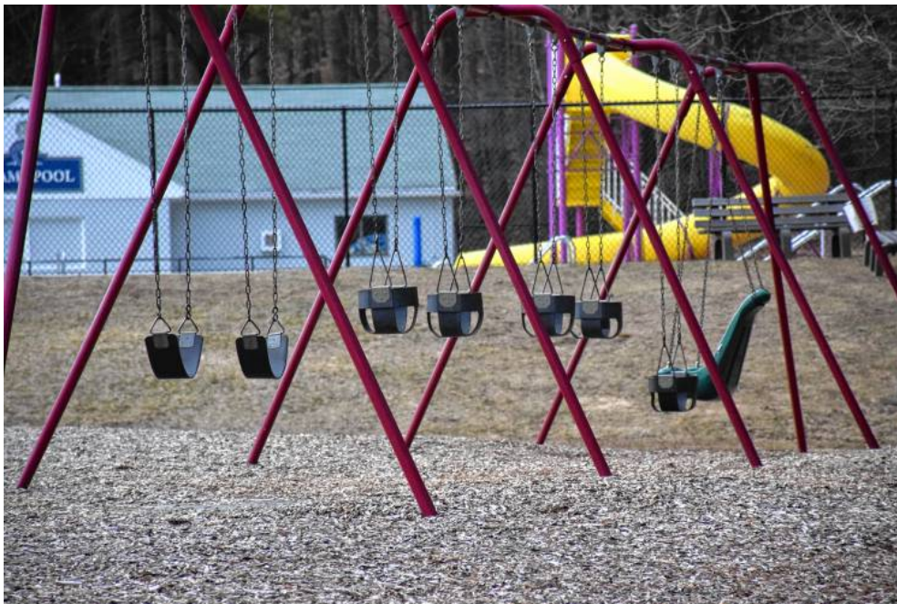
Adams Playground in Peterborough is now closed to the public.

By DAVID BROOKS (/byline?byline=By DAVID BROOKS)